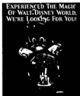
Disney often portrays Mickey Mouse as a Sorcerer.

24.5 minutes. Fairyland appears on the screen. The Fairies awake and fly through leaves. 'THERE'S YOUR FAIRIES. SHE IS VERY MAGICAL. SHE CAN CREATE ANYTHING AND SO CAN YOU.' "THE FAIRIES ARE SO MAGICAL."